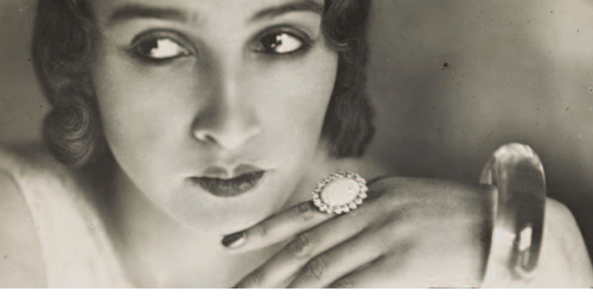
Photo Eye Avant-Garde Photography in Europe ...March 15, 2014 - July 6, 2014 Mary Stamas Gallery (Gallery 153)

Avenue of the Arts 465 Huntington Avenue Boston, MA 02115 www.mfa.org Adult, Youth, School, & Group Visits: 617-369-3310; groups@mfa.org HOURS: The MFA is open 7 days a week. Monday and Tuesday / 10 am–4:45 pm Wednesday – Friday / 10 am–9:45 pm Saturday and Sunday / 10 am–4:45 pm