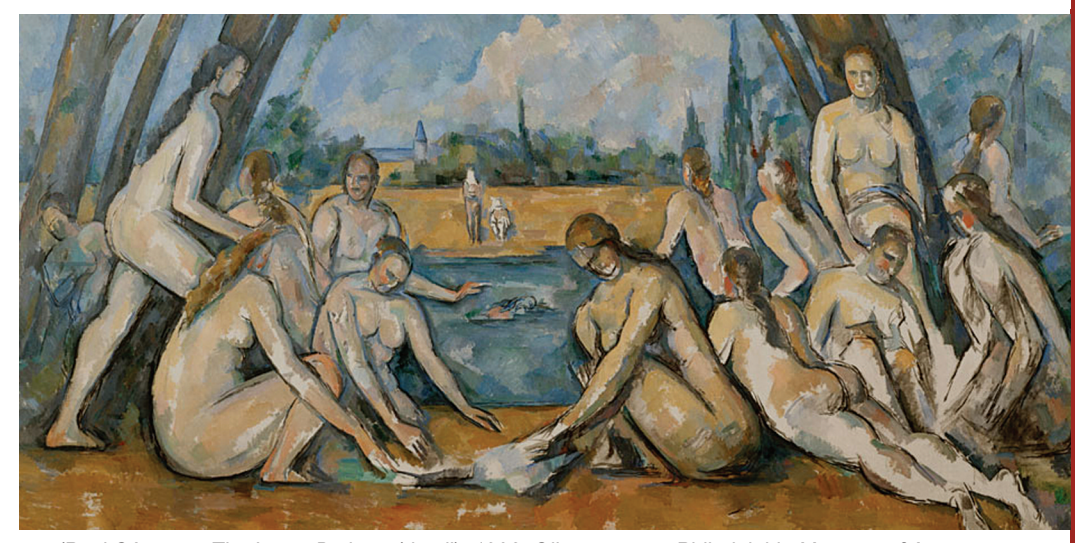
(Paul Cézanne, The Large Bathers (detail), 1906. Oil on canvas. Philadelphia Museum of Art: Purchased with the W.P. Wilstach Fund.)

Visiting Masterpieces Cézanne's The Large Bathers February 2, 2013 May 12, 2013 Gallery 255