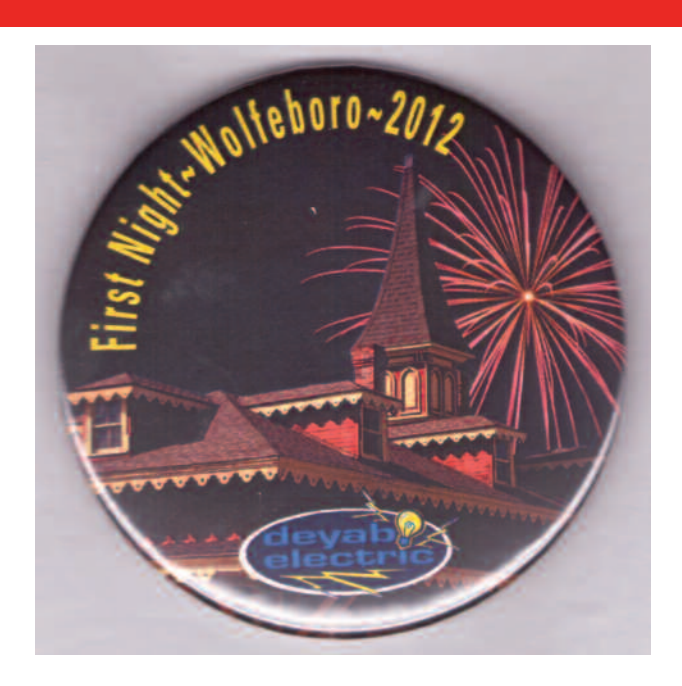
First Night® Wolfeboro EVENTS at a glance