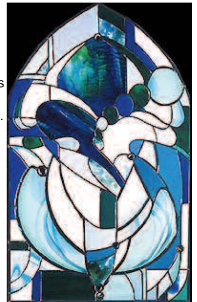
(blue stained glass church window by Cheryl Kumiski)

Time is Wednesday evenings 6:30 - 9:00pm or other evenings upon request. To register, contact Cheryl at 569-6439 .