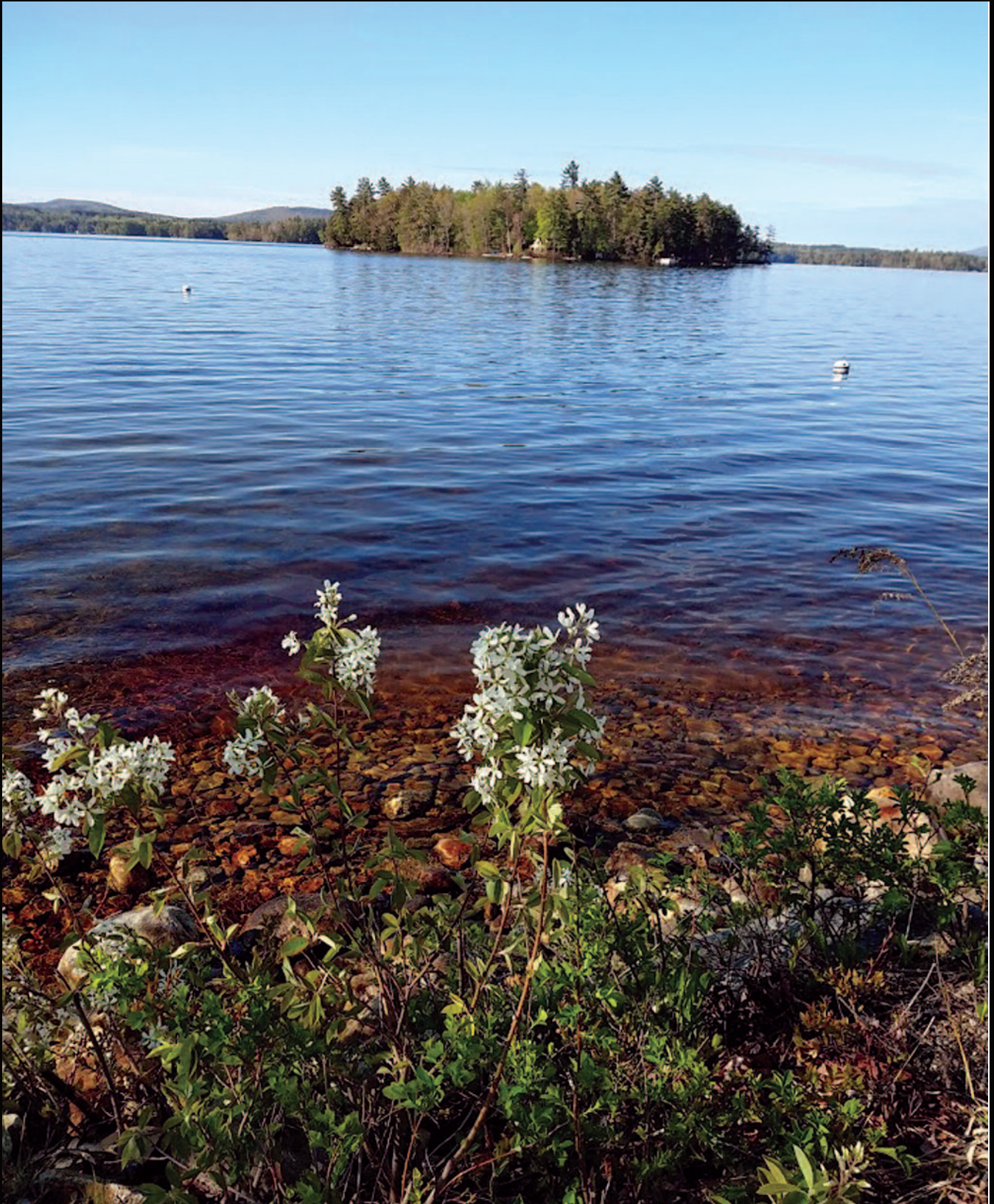
"Lake Wentworth"