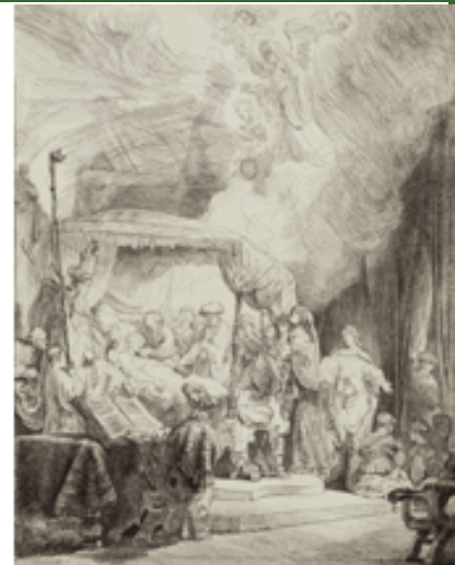
Image: Hendrick Goltzius, The Captain of the Infantry , 1587, Museum Purchase: The Henry Melville Fuller Acquisition Fund, 2010.26.7; Harmensz van Rijn Rembrandt, The Death of the Virgin , 1639, Museum Purchase: The Henry Melville Fuller Acquisition Fund, 2010.26.19